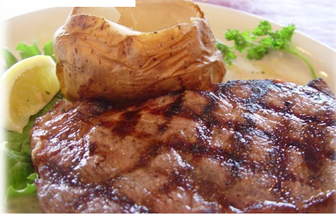
Delmonico Steak *

10 oz. Delmonico steak specially Seasoned, Char-Broiled to Your Order – 16.95