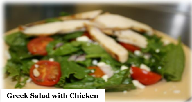
Greek Salad with Chicken