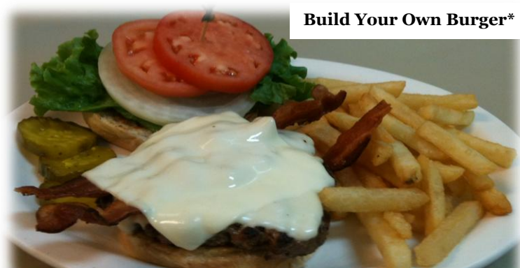
Build Your Own Burger*

All burgers are Char – Broiled to your liking and served with your choice of French fries or Steak fries and pickles!