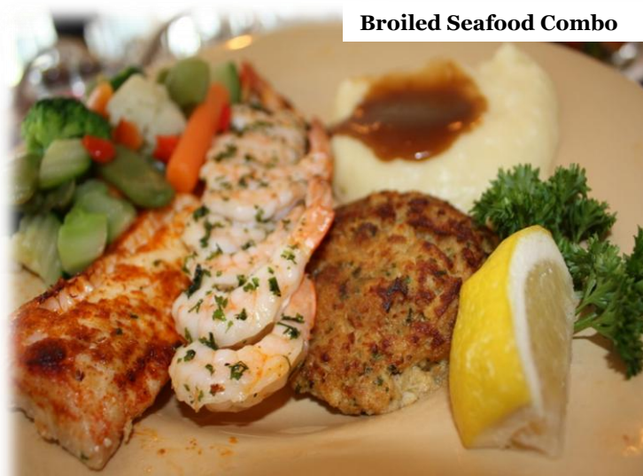
Broiled Seafood Combo

Entrées are served with your choice of two vegetables and fresh dinner rolls!