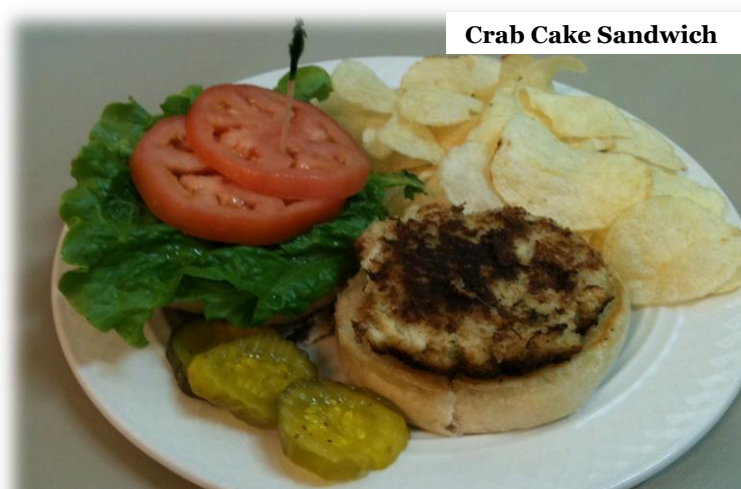
Crab Cake Sandwich