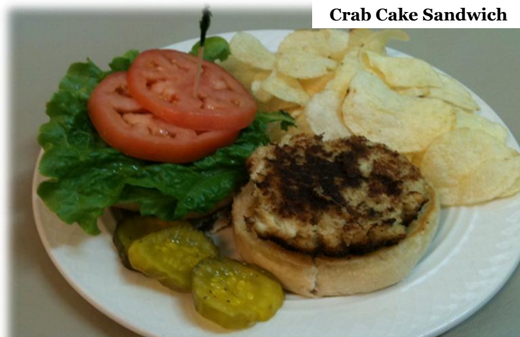
Crab Cake Sandwich

Looking for something different than just a grilled cheese, why not try adding Ham or Bacon served on your choice of bread – 6.95