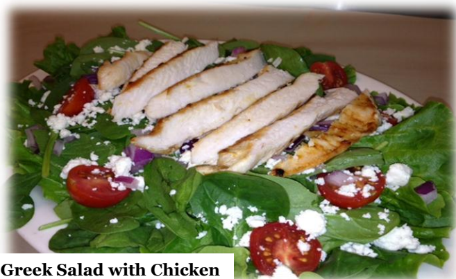
Greek Salad with Chicken