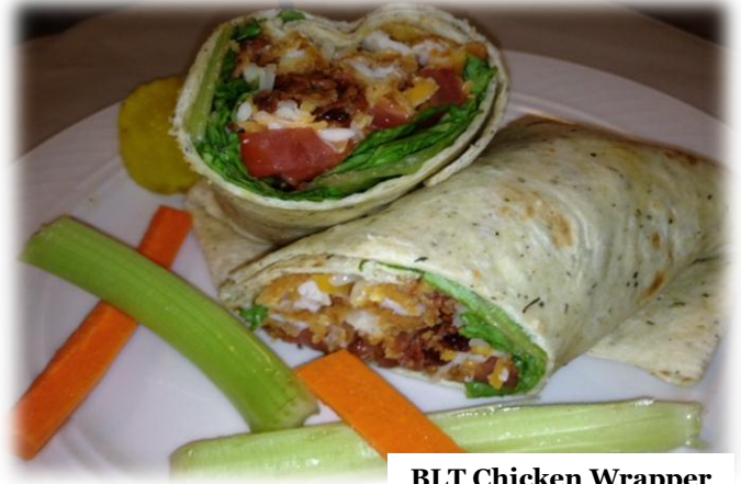
BLT Chicken Wrapper

Philly Style Steak Meat, Provolone Cheese, Sautéed Onions, Lettuce & Tomato, served in a Garlic Herb Wrapper with Marinara Sauce – 7.95