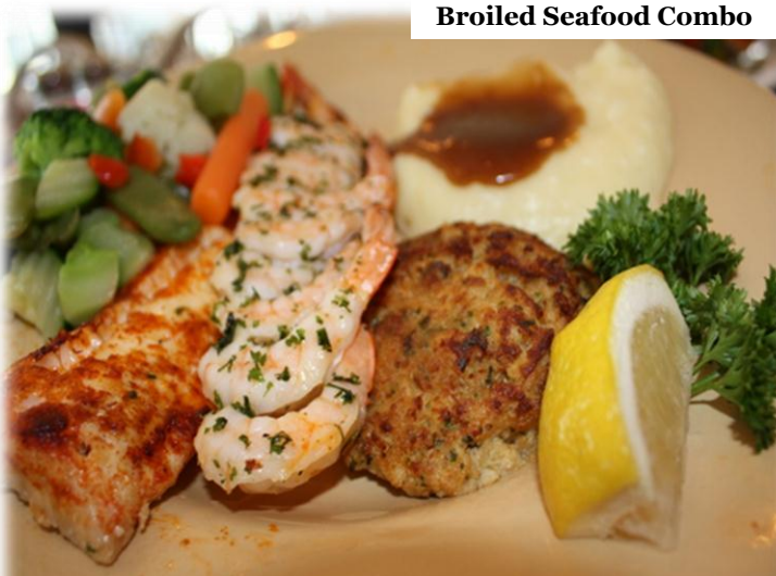
Broiled Seafood Combo

Entrées are served with your choice of two vegetables and fresh dinner rolls!