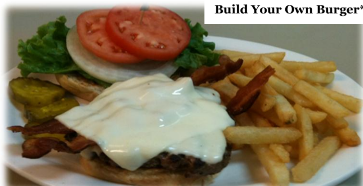
Build Your Own Burger*

All burgers are Char – Broiled to your liking and served with your choice of French fries or Steak fries and pickles!